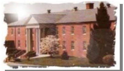
Cowan Trucking Systems