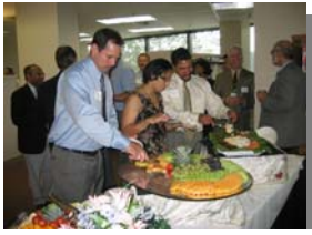
Kibart's 1st Open House