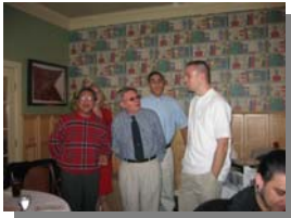
Traditional caroling by new employees of 2004